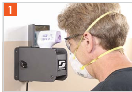
1 - Place forehead in front of thermometer