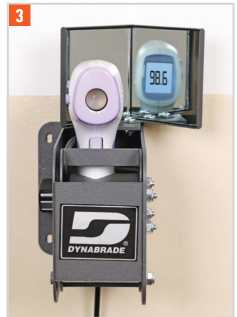
3 - View temperature number in mirror

This system is not intended to diagnose, prevent, or treat any disease or condition, and it is not intended for medical use. It measures skin temperature as a proxy for body temperature which is not 100% correlated. Specifications and undocumented specifications are subject to change without notice or liability.