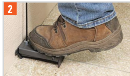
2 - Place foot on activation button